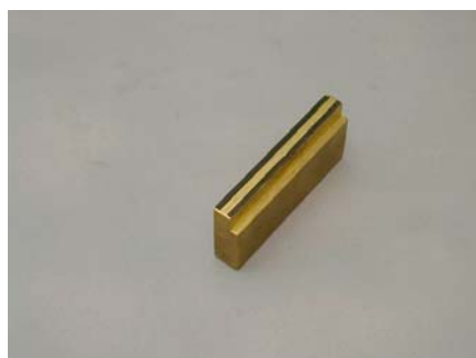
External Weight #4504