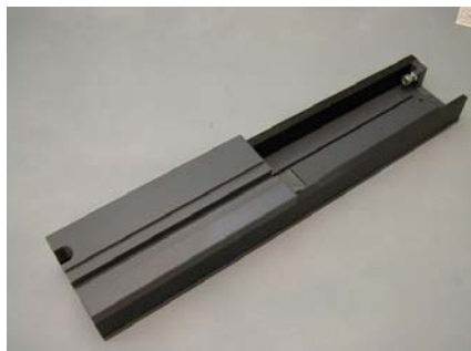
Insertion Jig #4502