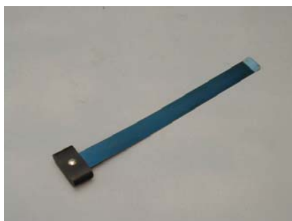
Insertion Tool Assistant #4505