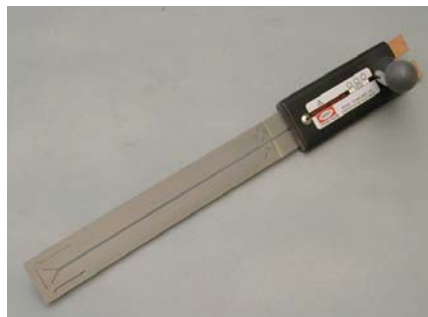
Insertion Tool #4500