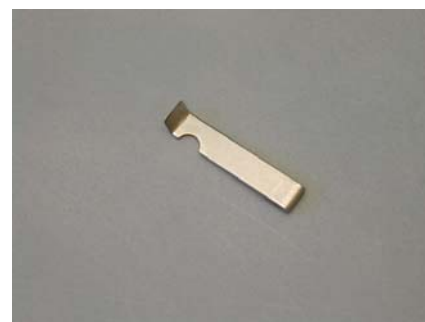
Metal Pressure Pad #4012