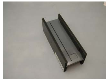
Cartridge Holder Jig #4503