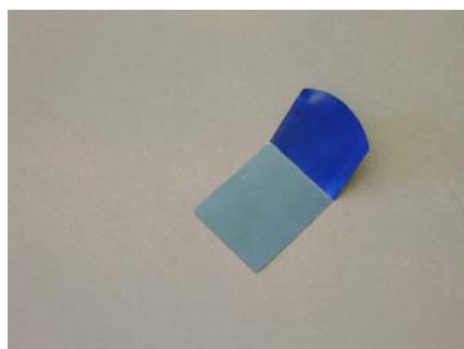
Foam Protector #4014