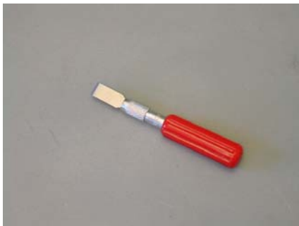
X-Acto Knife #4018