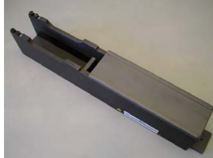
Insertion Jig #456