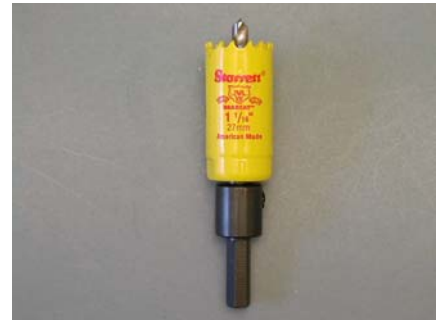
Fill-hole Cutter 1 1/16" #2117