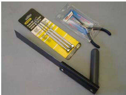
OEM Ribbon Removal Kit #8020