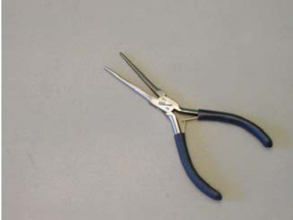
Needle-nose Pliers #1505