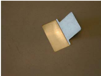
Foam Protector #462