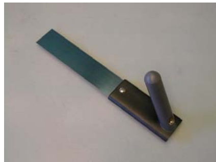
Ribbon Removal Tool #8022