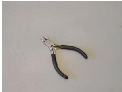
Diagonal Cutters #4029