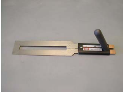
Insertion Tool #453